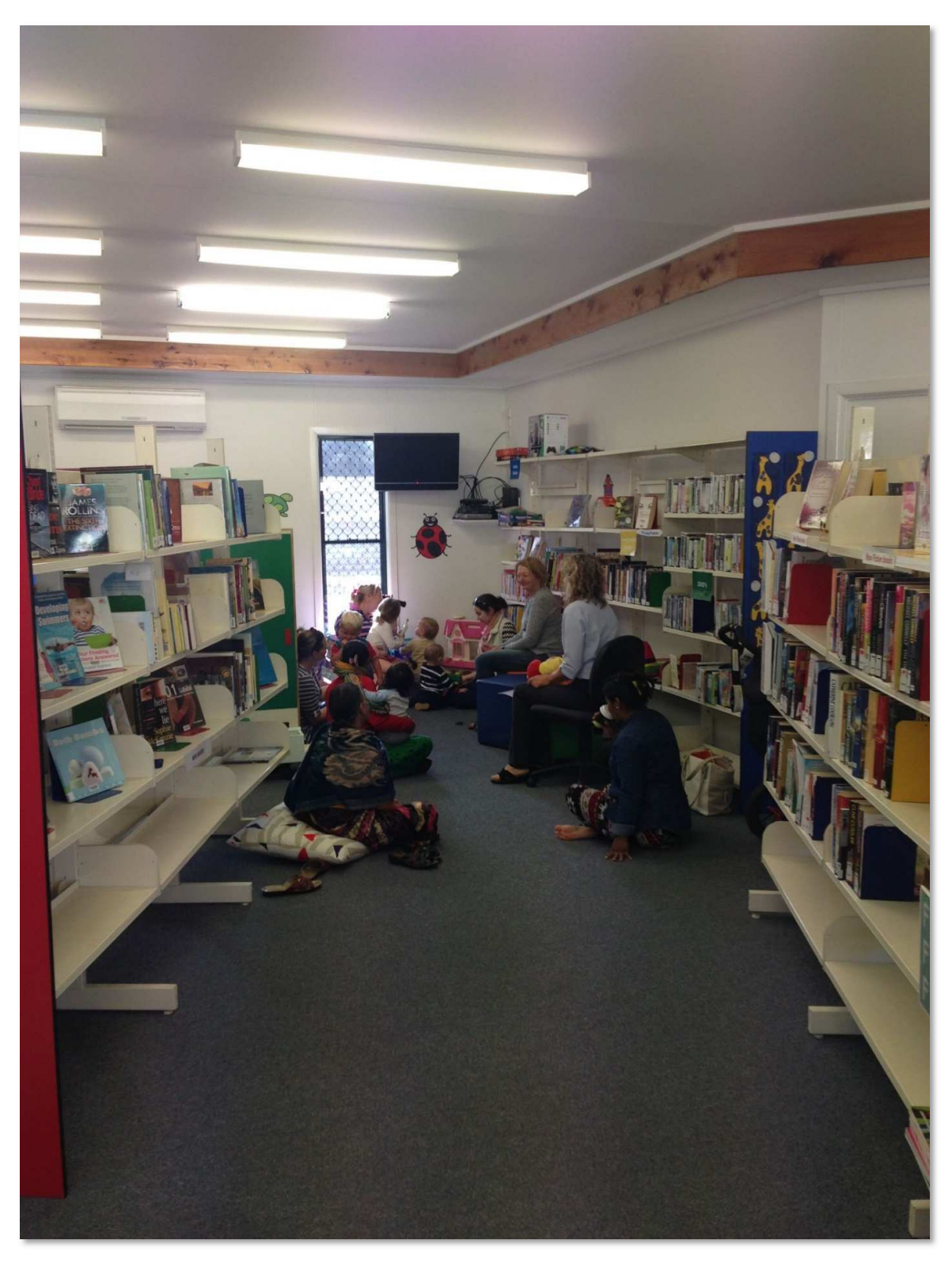
First 5 Forever now being delivered across Queensland through libraries in communities as small as Injune (population 461)

State Library of Queensland looks forward to continuing to work in partnership with public libraries and Indigenous Knowledge centres to deliver First 5 Forever to Queensland families in 2018-19. Thank you to all council staff, community partners and local champions who have contributed to the ongoing success of this program.