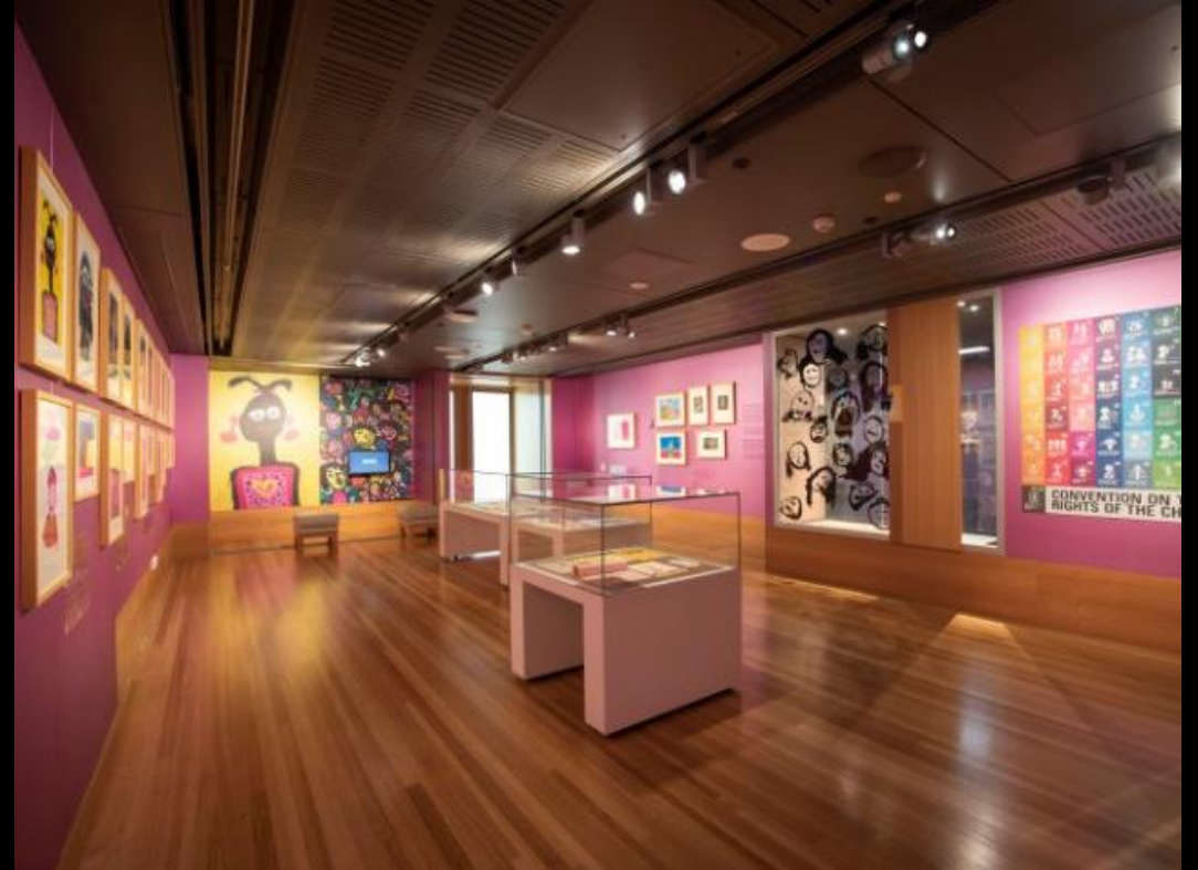
Big Voices: Children's Art Matters Image, 2020 , Leif Ekstrom, Corporate Image Library, State Library of Queensland