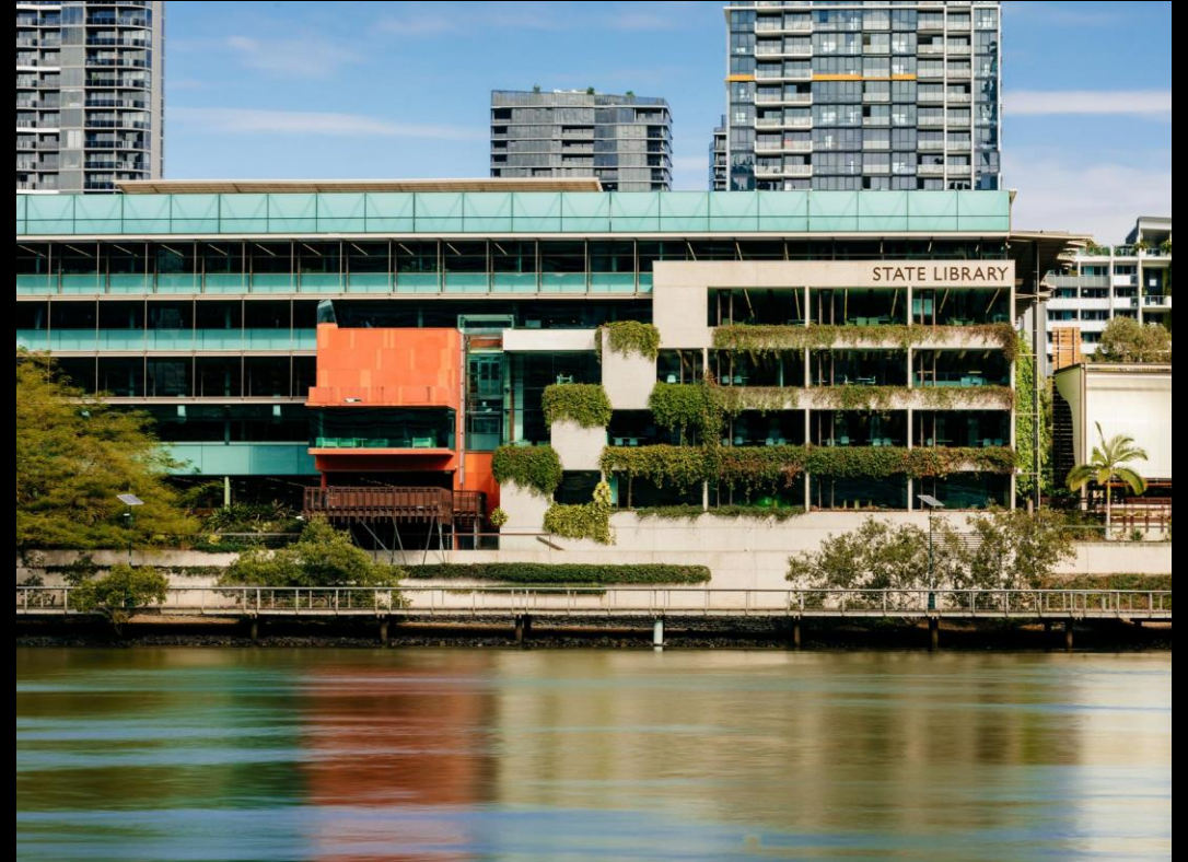
Exterior of State Library Building