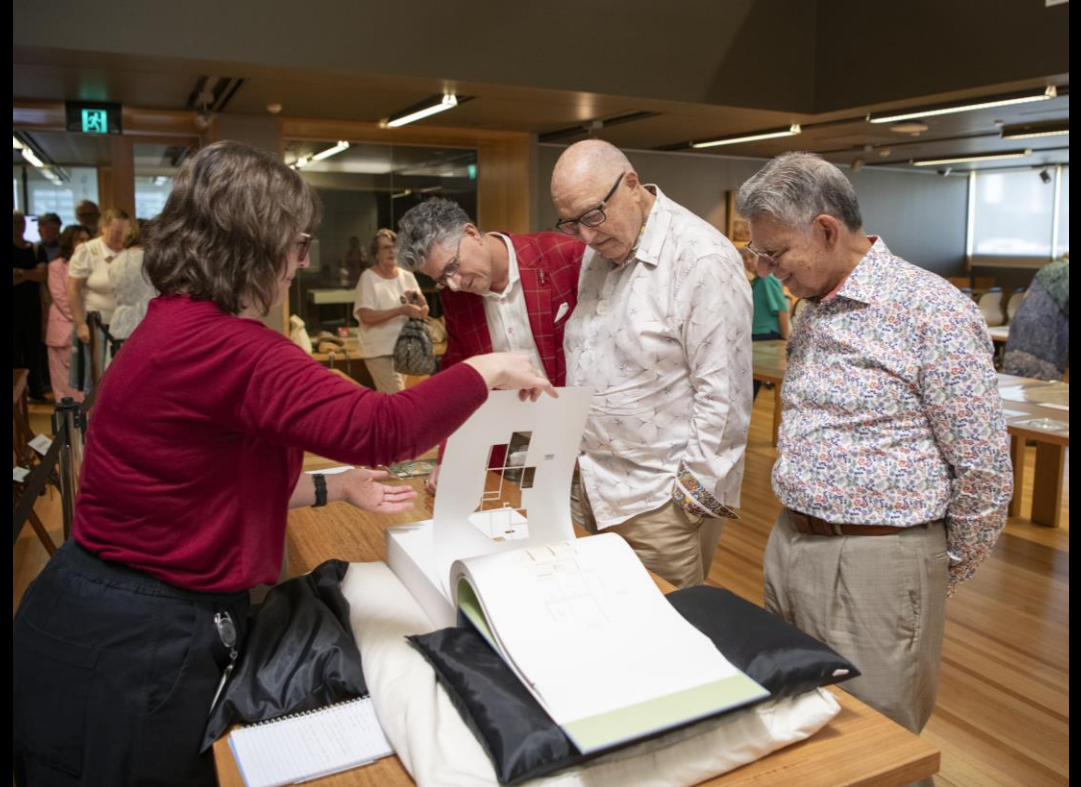
Heritage Talks: Houses and Homes 051 , 25 Nov 2024 , Josie Huang, Corporate Image Library, State Library of Queensland