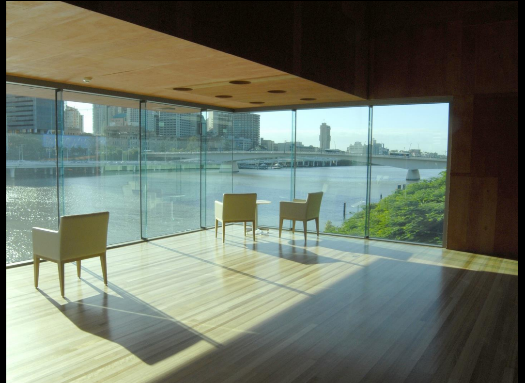
Brisbane River viewed from the Red Box at the State Library of Queensland, 2006