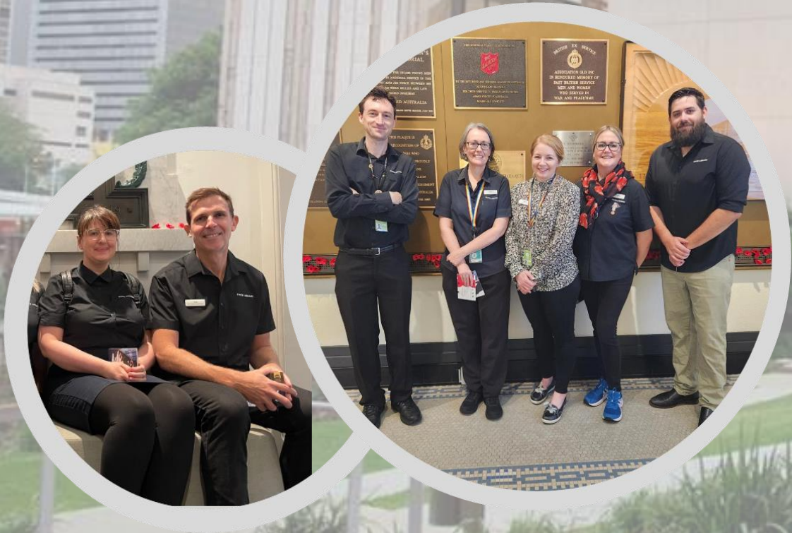
Schools Engagement team State Library of Queensland, 2024