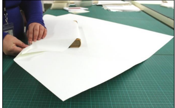
4. Crease the side on the right and fold over.