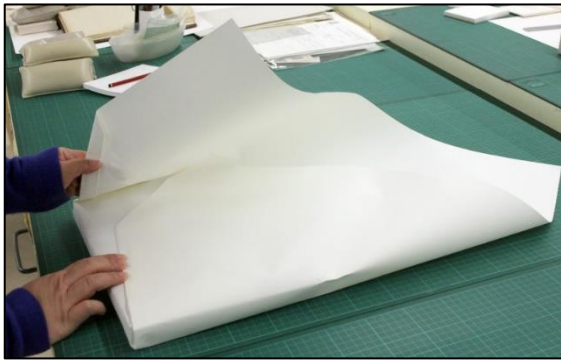
5. Do the same for the left.