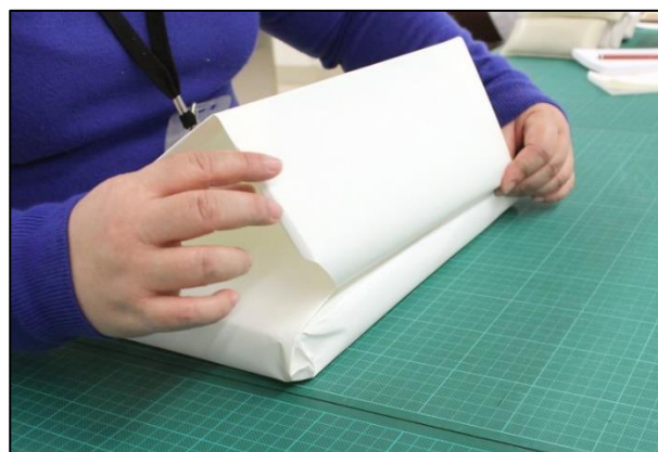
8. Turn book over then tuck in.