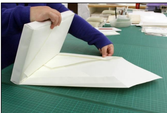
7. Fold book over.