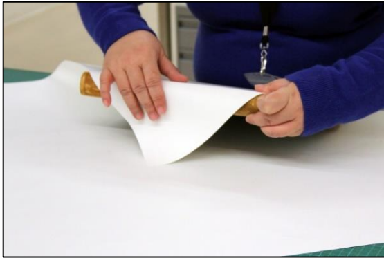
3. Tuck paper under book.