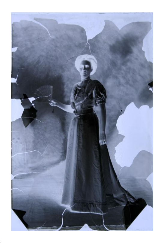
The damage on the glass plate negative (above) occurs when the gelatine emulsion swells and contracts in response to changes in humidity. The emulsion eventually lifts completely off the glass base causing large areas of image loss.

There are various specific recommendations for T and RH storage conditions according to different photograph and negative materials. Bertrand Lavédrine's book Photographs of the Past, Process and Preservation (2007, p. 283) provides a very useful table of recommendations. Collecting institutions often work to these set points recommendations, but they may not be realistic for personal collections in the home. The general theory is that cooler storage temperatures will result in a longer lifespan for collection materials. Selecting a cool and stable environment with minimal T and RH fluctuations will be very beneficial for your photograph collection.