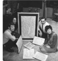
Photograph - 1970