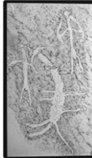
Photograph - 1970