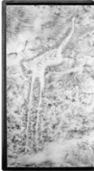
Photograph - 1970