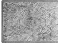
Photograph - 1970 Aboriginal people and Torres Strait Islander peoples - Art - Copies of ancient rock carvings by Aboriginals of the Mootwingee District, 1970