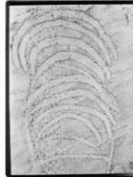
Photograph - 1970