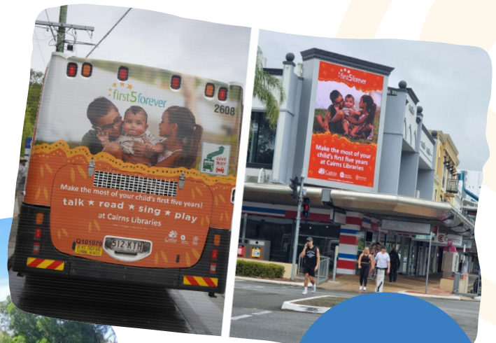
Cairns Libraries marketing and promotion images