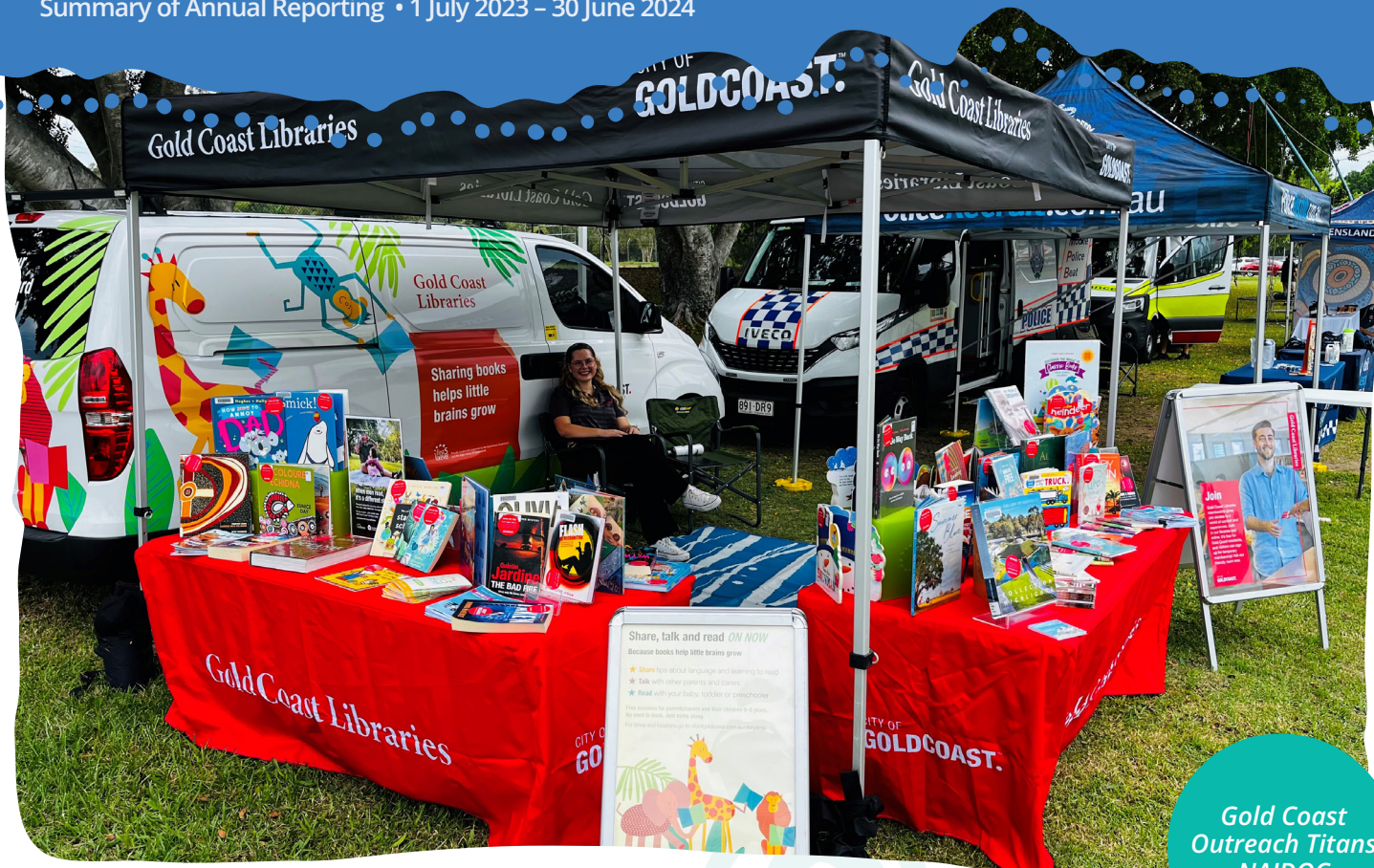
Gold Coast Outreach Titans NAIDOC

Libraries continue to prioritise building new partnerships and strengthening existing ones to meet the needs and interests of their communities, as evidenced by this summary: