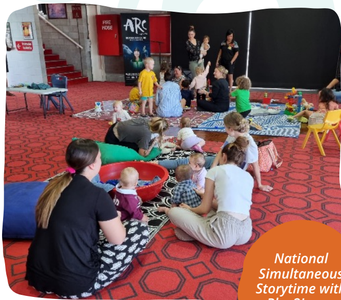
National Simultaneous Storytime with Play2Learn