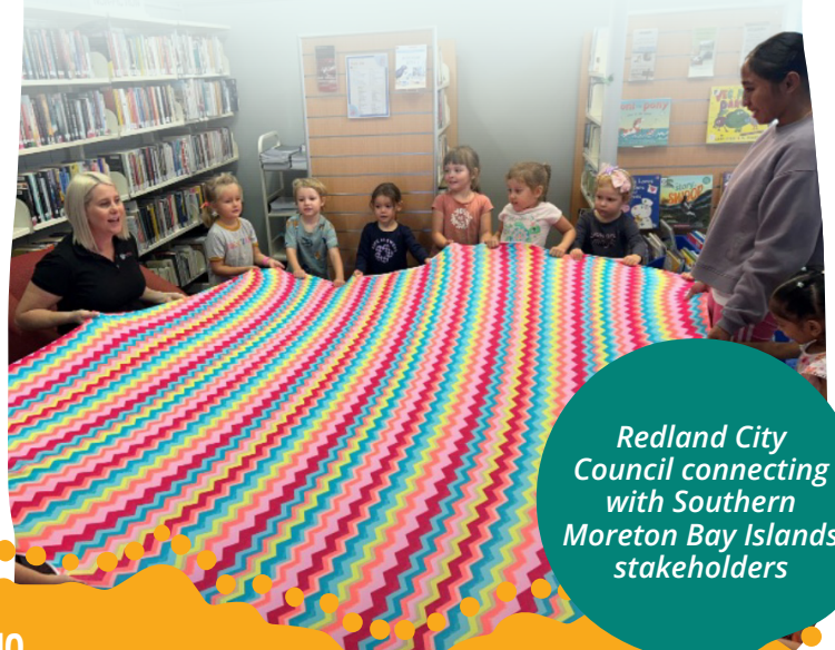
Redland City Council connecting with Southern Moreton Bay Islands stakeholders

Partner sessions have had a 247% increase while the number of sessions delivered was 694 – a 37% increase. 66 partner sessions were reported which was a 247% increase since 2022–2023 with overall attendance 22,795, a 28% increase.