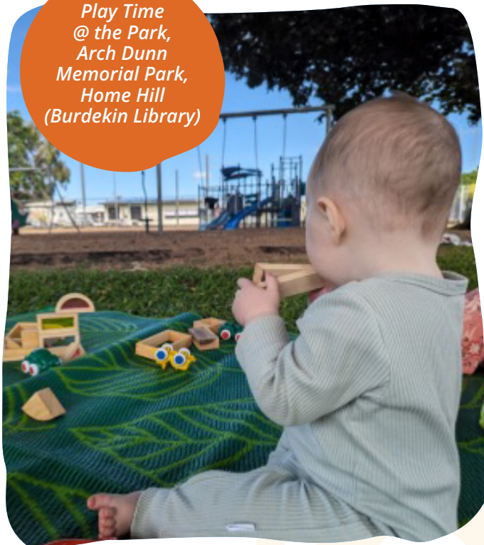
Play Time @ the Park, Arch Dunn Memorial Park, Home Hill