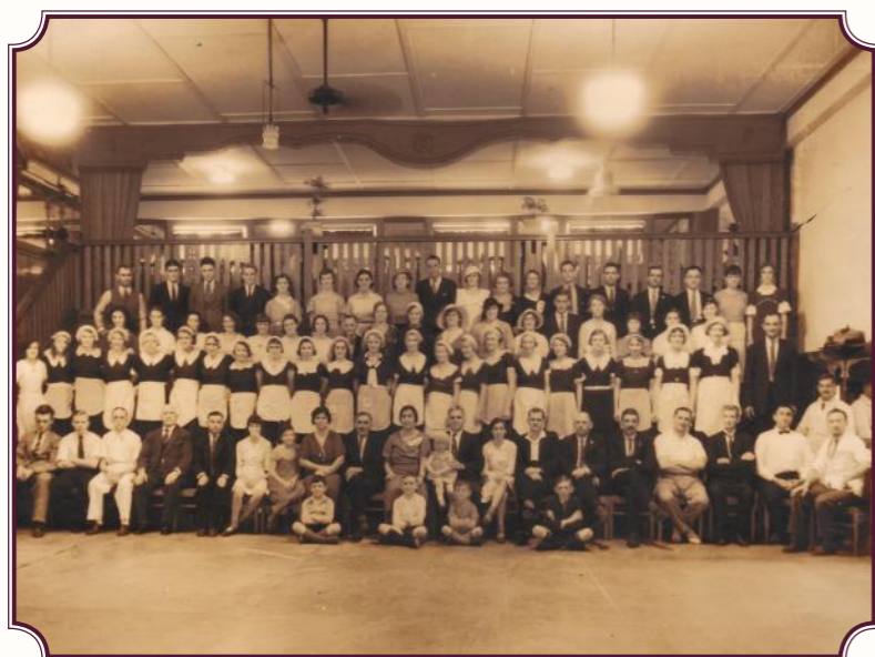
Staff at Comino's Cafe, Cairns, 1934