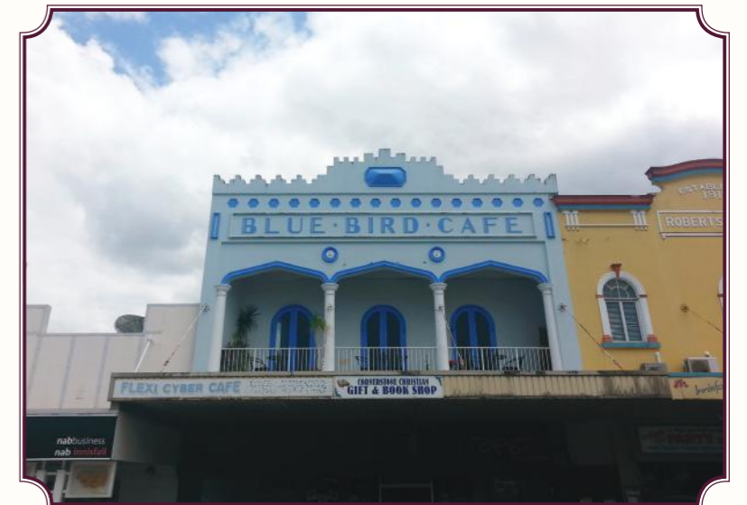
The Blue Bird Cafe building still stands, Rankin Street, Innisfail, 2014

White jackets for men and crisp white caps and aprons for waitresses embodied the cleanliness, civility and service advertised by shops like Townsville's popular Blue Bird Cafe