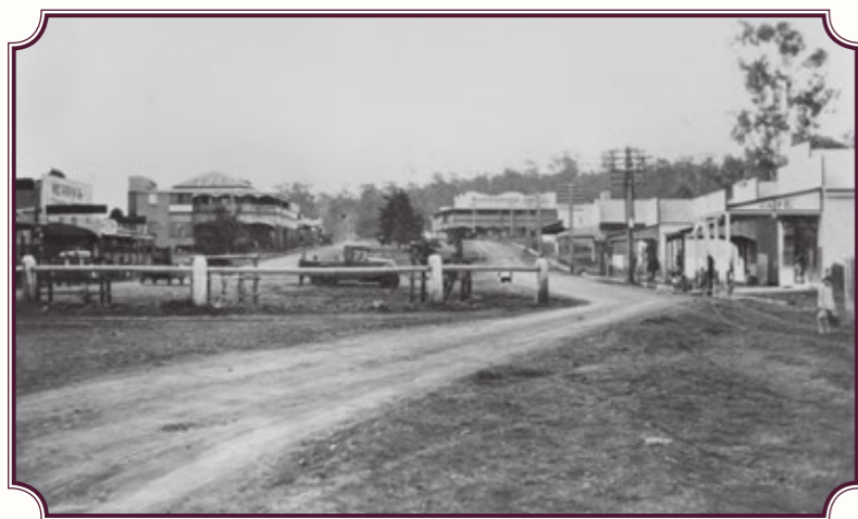
Shops and buildings in Grigg Street, Ravenshoe, ca. 1927