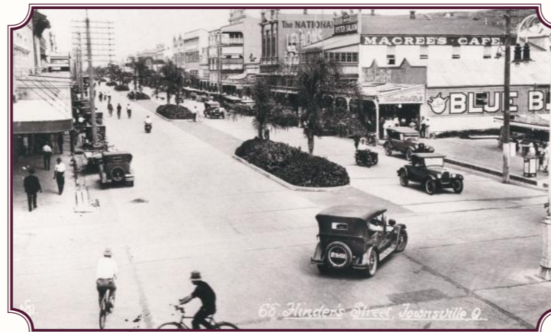
Flinders Street, Townsville, 1928

In addition to Townsville's Blue Bird Cafe in Flinders Street, Greeks operated Blue Bird Cafes in the north Queensland towns of Cairns, Gordon Vale, Yeppoon, Charters Towers, Innisfail, Bowen, Rockhampton and Mareeba