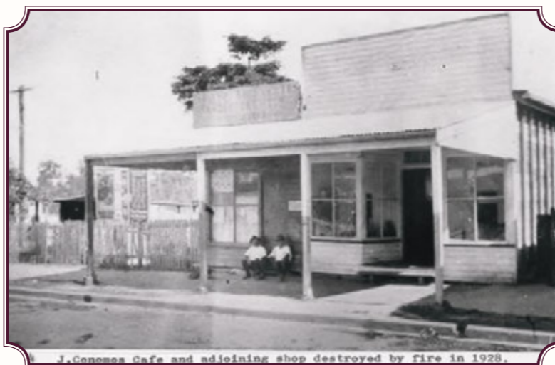
Conomos Cafe in Munro Street Babinda, ca. 1920s

Like many others, the Popular Cafe in Ravenshoe caught fire at some time in its history and was rebuilt. The cafe still operates and retains many early cafe features